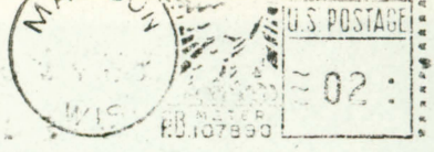
UNIVERSITY of WISCONSIN STATE of WISCONSIN GENERAL HOSPITAL MADISON WISCONSIN