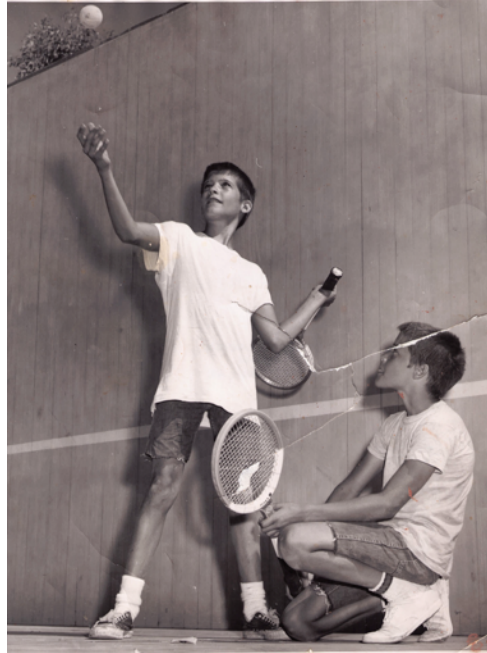
The Newspaper Photo

I wasn't a good student. I never learned the rules of tennis, and I didn't attend the final competition because I was playing on a big swing some 200 yards from the tennis court. For this reason, I must not have got a very good grade though I really don't remember if they gave us grades or not.