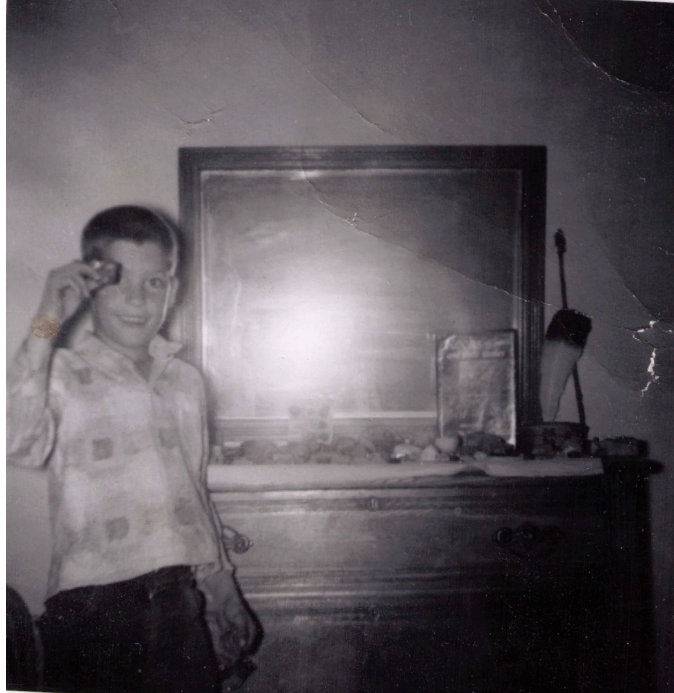
Me (or my twin) as a youth posing in front of our mineral collection.